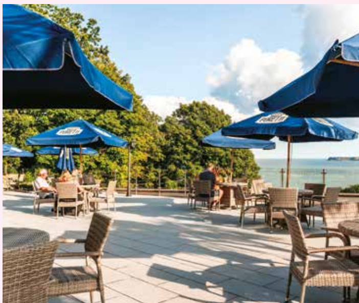
Headland Hotel ★★

How to book: Book online and enter the code or call and quote your code.