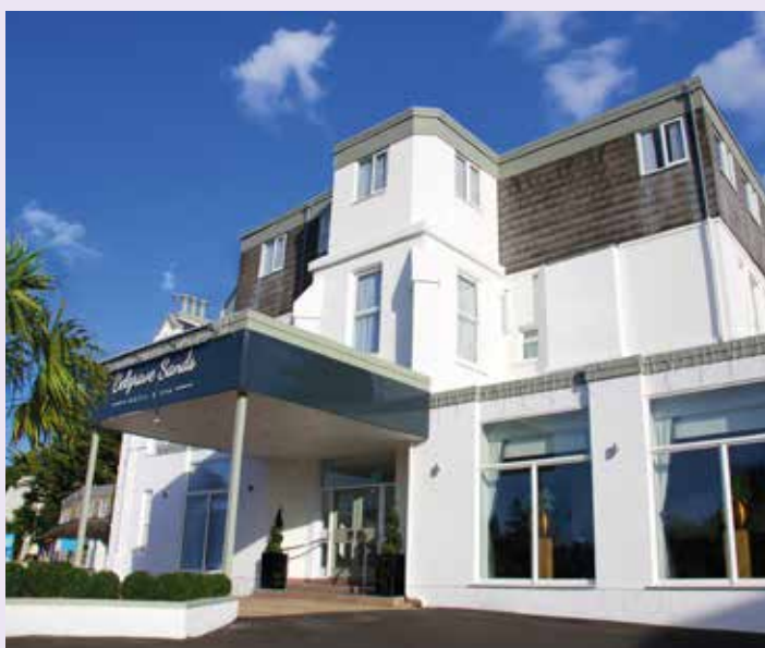
Belgrave Sands Hotel ★★