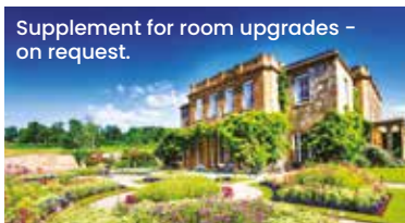
Supplement for room upgrades - on request.

Price pp based on 2 sharing includes: 4 nights D/B/B basis plus excursions. Single supplement £40