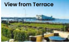
View from Terrace