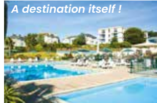
A destination itself !

Hotel: TLH Resort. Superb complex of 4 hotels, pools and nightly entertainment ★★★ Price includes: 4 nights D/B/B plus excursions.