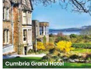
Cumbria Grand Hotel

Hotel: Cumbria Grand, Grange-over-Sands ★★★ Price includes: 4 nights D/B/B plus excursions.