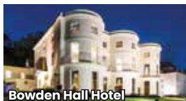
Bowden Hall Hotel