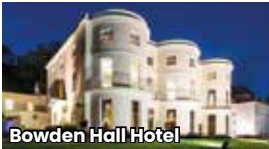
Bowden Hall Hotel

Day 1: Arrive at the Bowden Hall for 4 nights. Day 2: Ross-on-Wye and cruise on River Wye. Day 3: Delightful Spa town of Cheltenham. Day 4: Hellens Tudor Manor House and Ledbury. Day 5: Homeward bound.